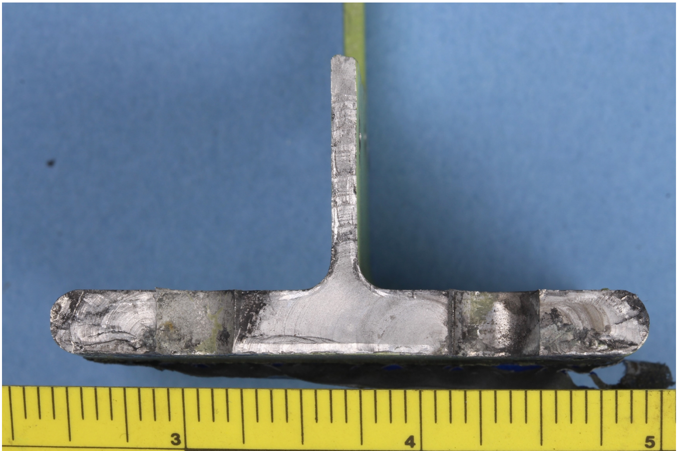
Figure 1 - Left wing main spar lower cap fracture surface.

examination. Preliminary examination of the left wing main spar revealed that more than 80% of the lower spar cap and portions of the forward and aft spar web doublers exhibited fracture features consistent with metal fatigue (see figure 1).