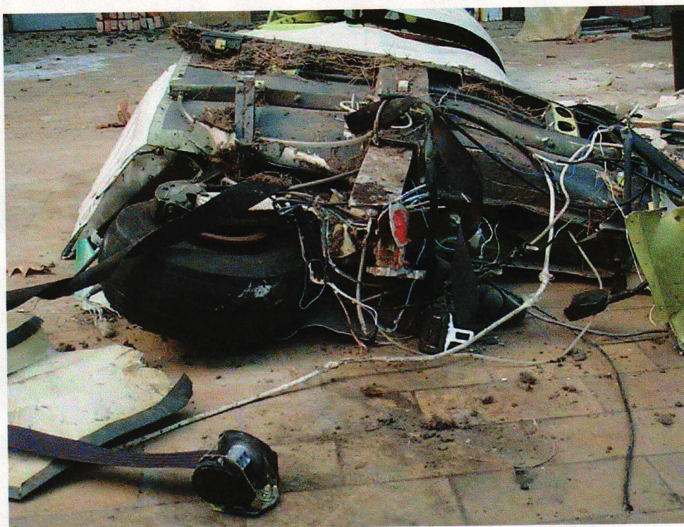
Picture 9 : View on the remains of the LH wing. Here the wing lies with its upper surface up. Note the I-beam in the middle of the picture where the fracture occurred.